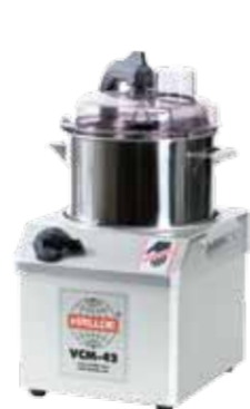
Vertical Cutter/Mixers VCM-42

VCM-42 is the choice for the professional small to mid-size kitchen. The VCM-42 is robustly built in all-aluminium with direct drive and ergonomic user-friendly design. Built in handles for easy mobility and scraper system for perfect results. VCM-42 chops and grinds meat, fish, vegetables, fruits, nuts, etc., and blends and mixes all sorts of sauces, soups, dressings and desserts.