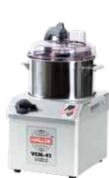
Vertical Cutter/Mixers VCM-41

VCM-41 is the choice for the professional small to mid-size kitchen. The VCM-41 is robustly built in all-aluminium with direct drive and ergonomic user-friendly design. Built in handles for easy mobility and scraper system for perfect results. VCM-41 chops and grinds meat, fish, vegetables, fruits, nuts, etc., and blends and mixes all sorts of sauces, soups, dressings and desserts.