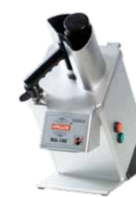
Vegetable Preparation Machine RG-100

Bowl: 3 litres Gross volume and 1.4 litre net volume