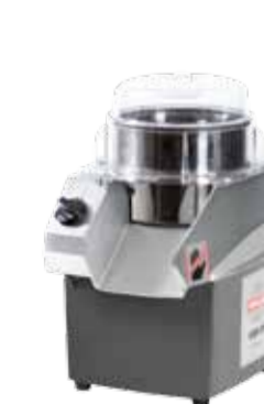
Vertical Cutter/Blender VCB-31S

VCB-31S is our entry-level model in the vertical cutter blender segment. The VCB-31S is robustly built in an ergonomic user-friendly design with low weight and built in handles for easy mobility.