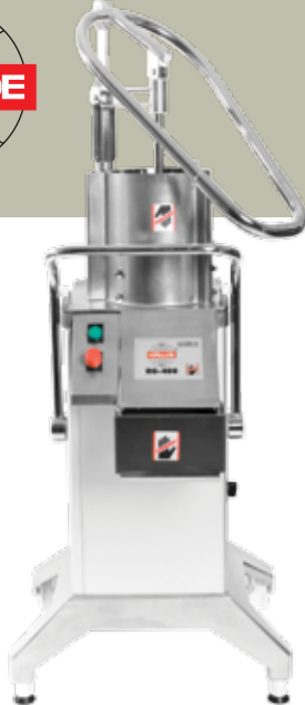
Vegetable Preparation Machine RG-400

RG-400 is developed for very large-scale production with extremely high demand on output and cutting performance. With four customized attachments: Manual feeder ergo loop, pneumatic push feeder, 4-tube insert and feed hopper the RG-400 has its own place in the market. The floor model has robust handles and wheels for easy mobility. It can slice, dice, shred, grate, cut julienne, cut French fries and waffle vegetables, fruits, dry bread, cheese, nuts, mushrooms, etc. The RG-400 has robust all-aluminium construction with an ergonomic user-friendly design.