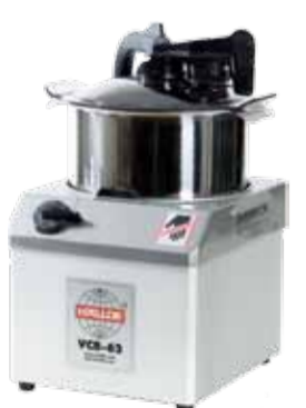
Vertical Cutter/Blenders VCB-62

VCB-62 is the choice for the professional mid-size to large kitchen. The VCB-62 has robust all-aluminium construction with direct drive and ergonomic user friendly design. Built in handles for easy mobility and scraper system for perfect results. VCB-62 chops and grinds meat, fish, vegetables, fruits, nuts, etc., blends and mixes all sorts of sauces, soups, dressings and desserts.