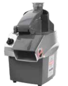
Vegetable Preparation Machine RG-50

Processes 3000 port/day and 15-40 kg/minute