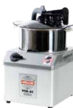
Vertical Cutter/Blenders VCB-61

VCB-61 is the choice for the professional mid-size to large kitchen. The VCB-61 is robustly built in all-aluminium with direct drive and ergonomic user-friendly design. Built in handles for easy mobility and scraper system for perfect results. VCB-61 chops and grinds meat, fish, vegetables, fruits, nuts, etc., and blends and mixes all sorts of sauces, soups, dressings and desserts.