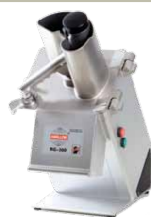
Vegetable Preparation Machine RG-300

Bowl: 6 litres Gross volume and 4.3 litre net volume