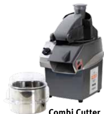
Combi Cutter CC-32

CC-32 is a combi cutter that is both a vegetable preparation machine and a vertical cutter. It is a table top model designed for small and mid-size kitchens. The model has low weight and handles for easy mobility.