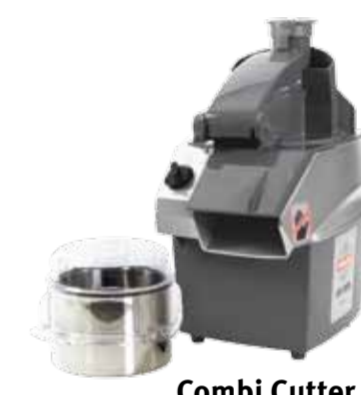
Combi Cutter CC-32S

CC-32S is our entry-level combi cutter that is both a vegetable preparation machine and a vertical cutter. It is a table top model designed for small and mid-size kitchens. The model has low weight and handles for easy mobility.