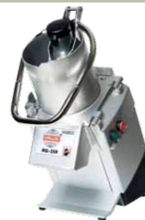
Vegetable Preparation Machine RG-250

Bowl: 4 litres Gross volume and 1.5 litre net volume