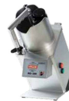
Vegetable Preparation Machine RG-200

Bowl: 4 litres Gross volume and 1.5 litre net volume