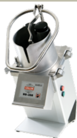
Vegetable Preparation Machine RG-350

Bowl: 6 litres Gross volume and 4.3 litre net volume