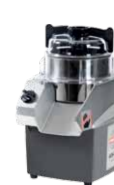
Vertical Cutter/Blender VCB-32

The VCB-32 is robustly built in an ergonomic user-friendly design with low weight and built in handles for easy mobility.