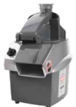
Vegetable Preparation Machine RG-50S

Processes 1200 port/day and 12-30 kg/minute