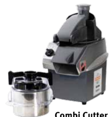
Combi Cutter CC-34

Processes 100-800 port/day and 7 kg/minute